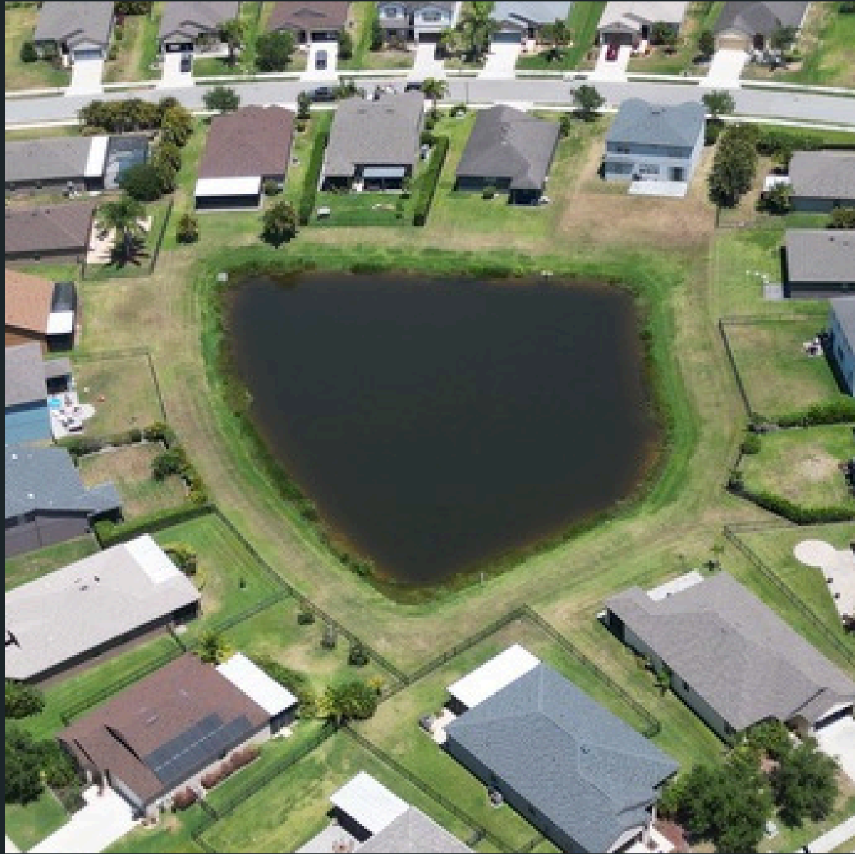
Pond #SWF38 Treated for Shoreline Vegetation.