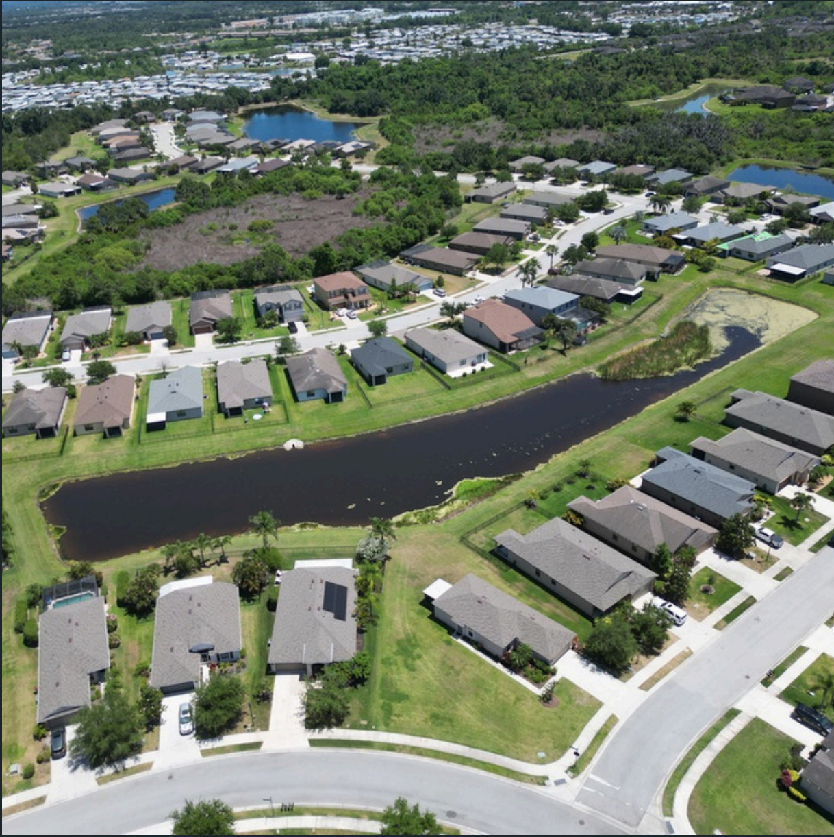
Pond #SWF32 Treated for Algae and Shoreline Vegetation.