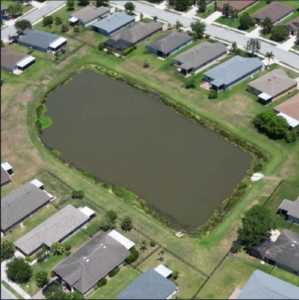
Pond #SWF35 Treated for Shoreline Vegetation.