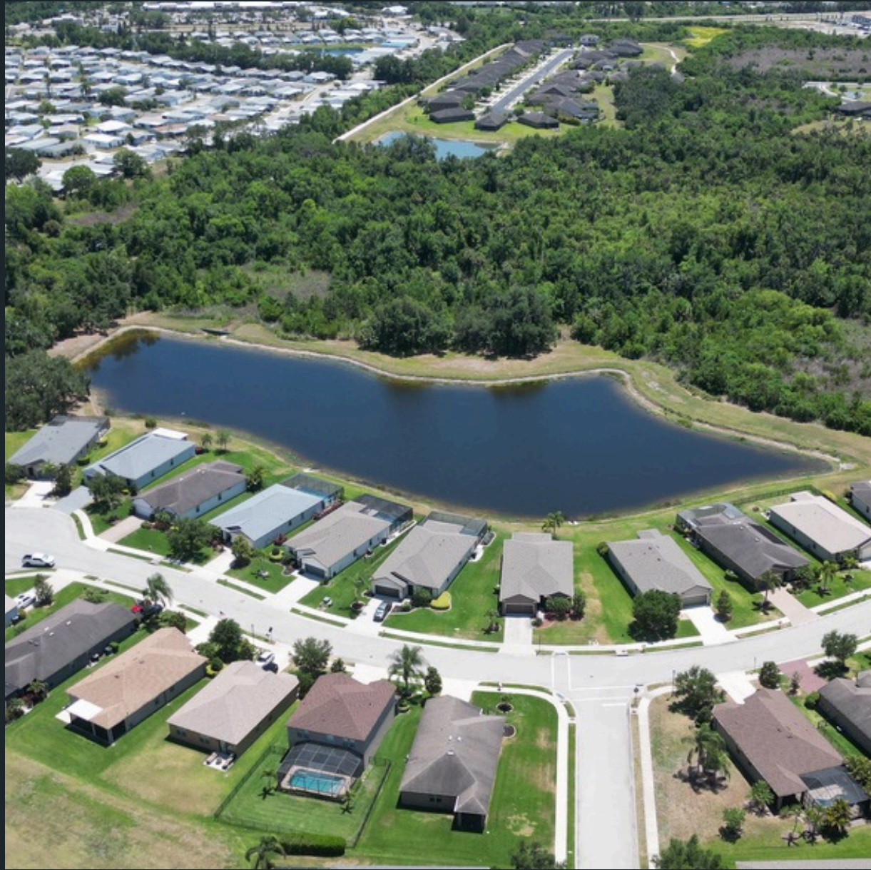
Pond #SWF31 Treated for Shoreline Vegetation.