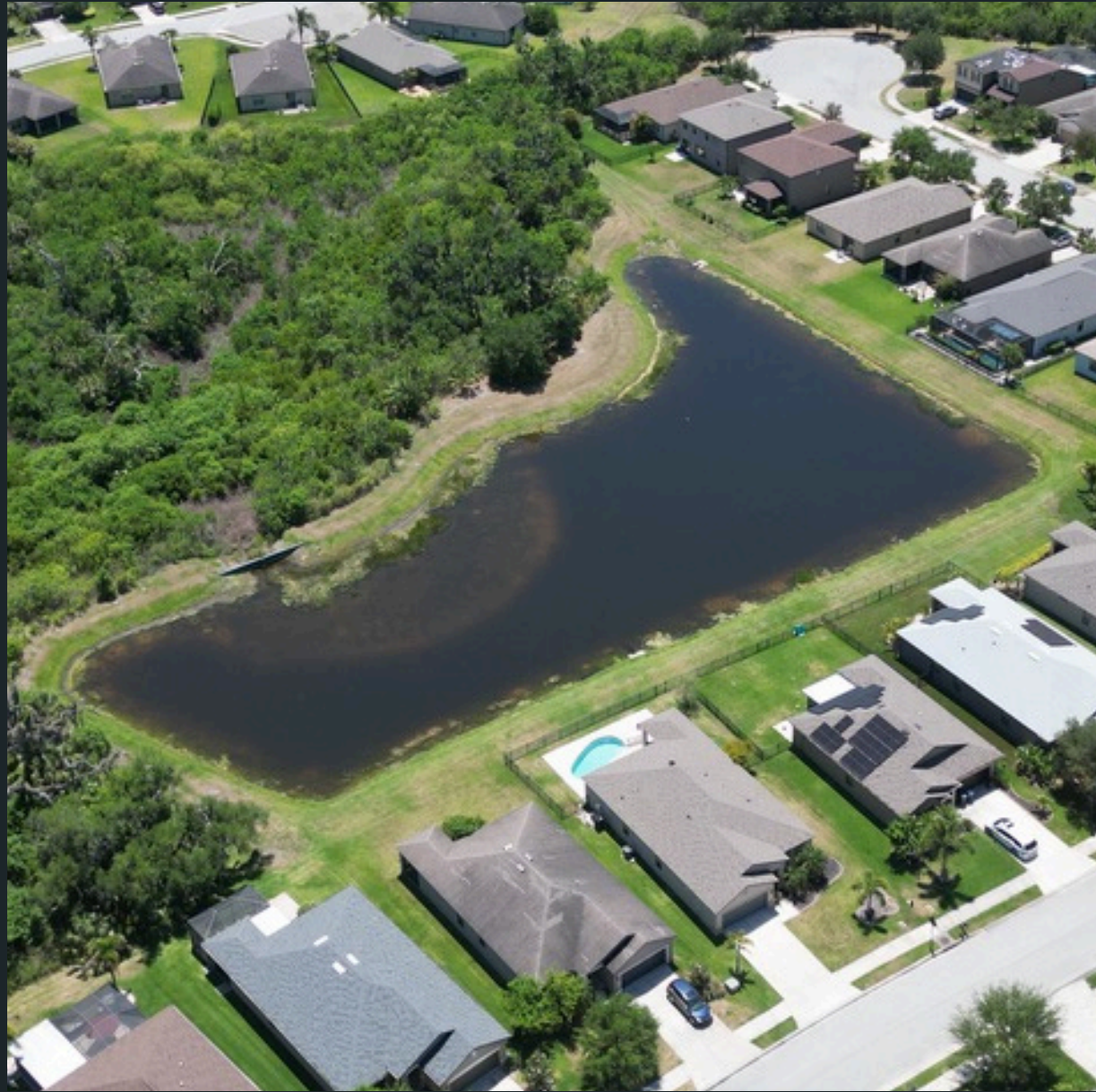
Pond #SWF30 Treated for Shoreline Vegetation.