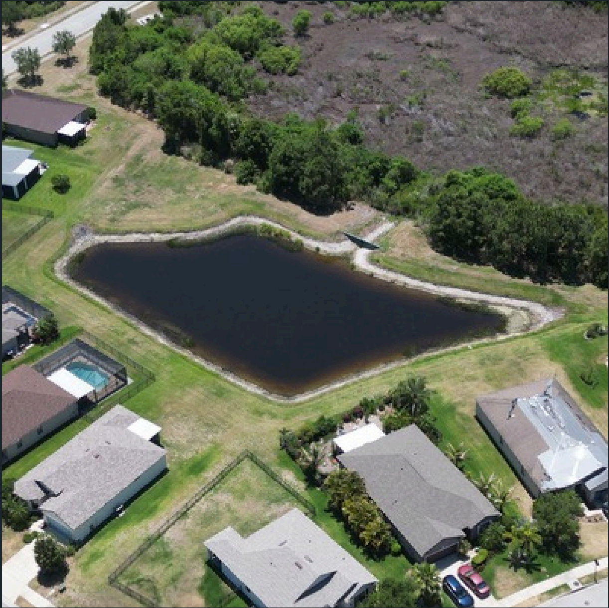
Pond #SFW33 Treated for Shoreline Vegetation.