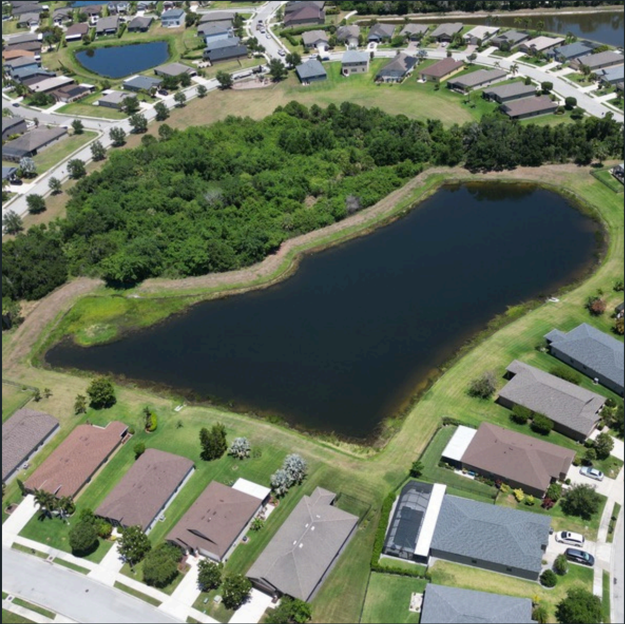
Pond #SWF37 Treated for Shoreline Vegetation.