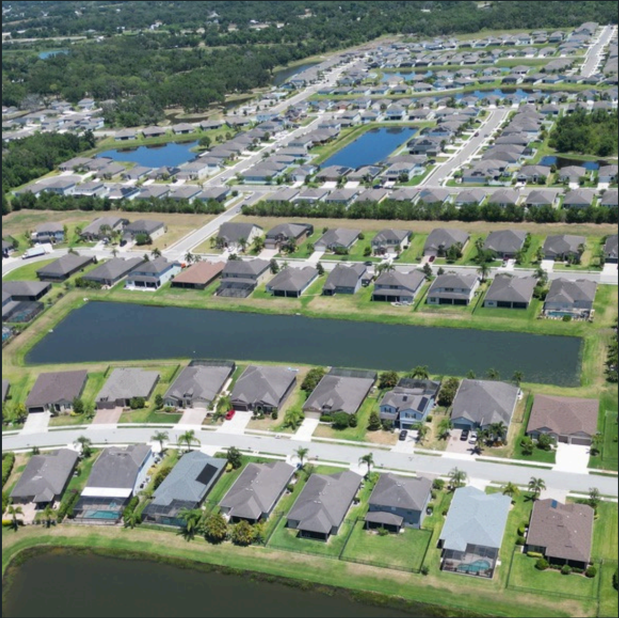
Pond #SWF40 Treated for Algae and Shoreline Vegetation.