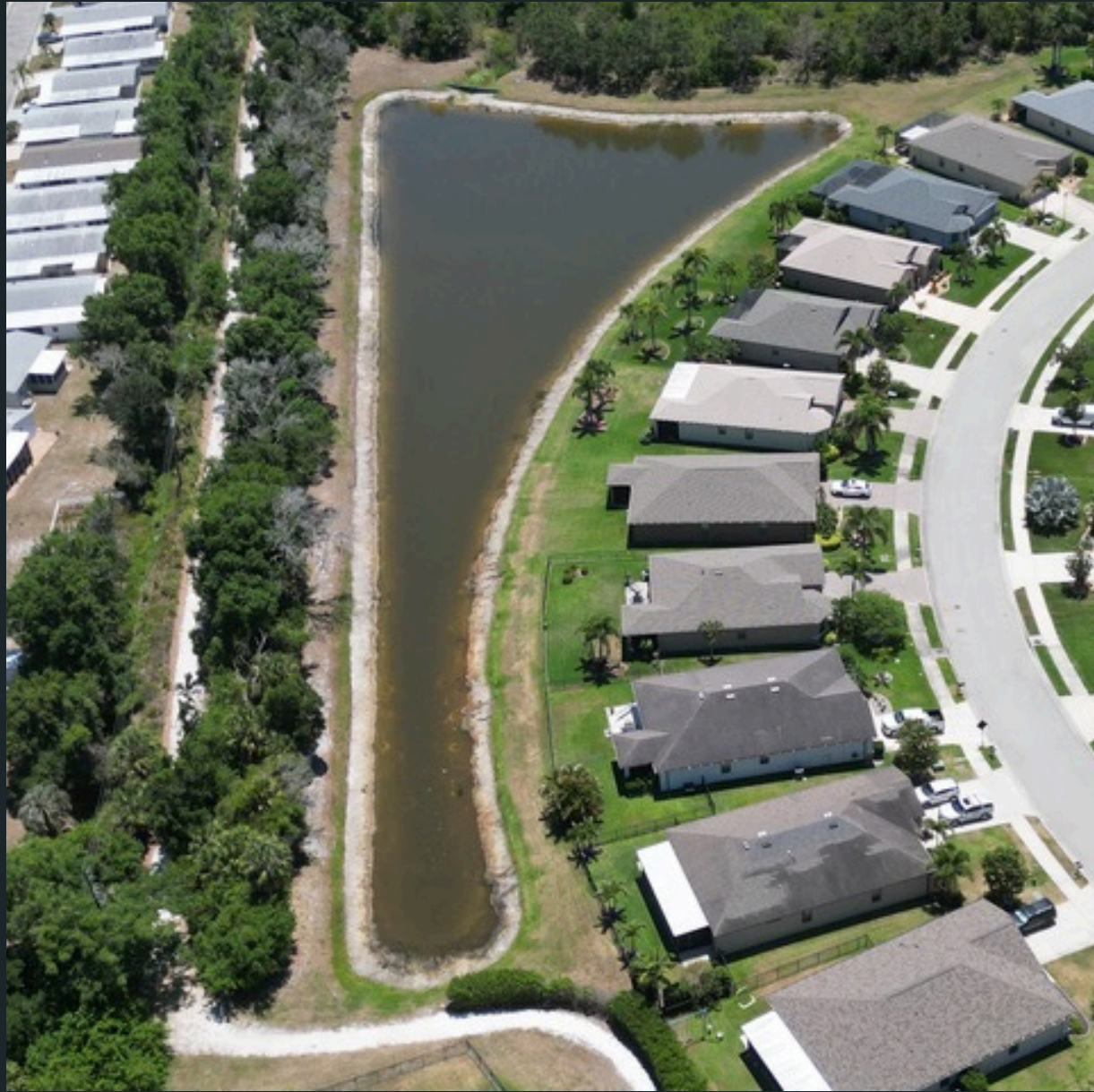
Pond #SWF42 Treated for Shoreline Vegetation.