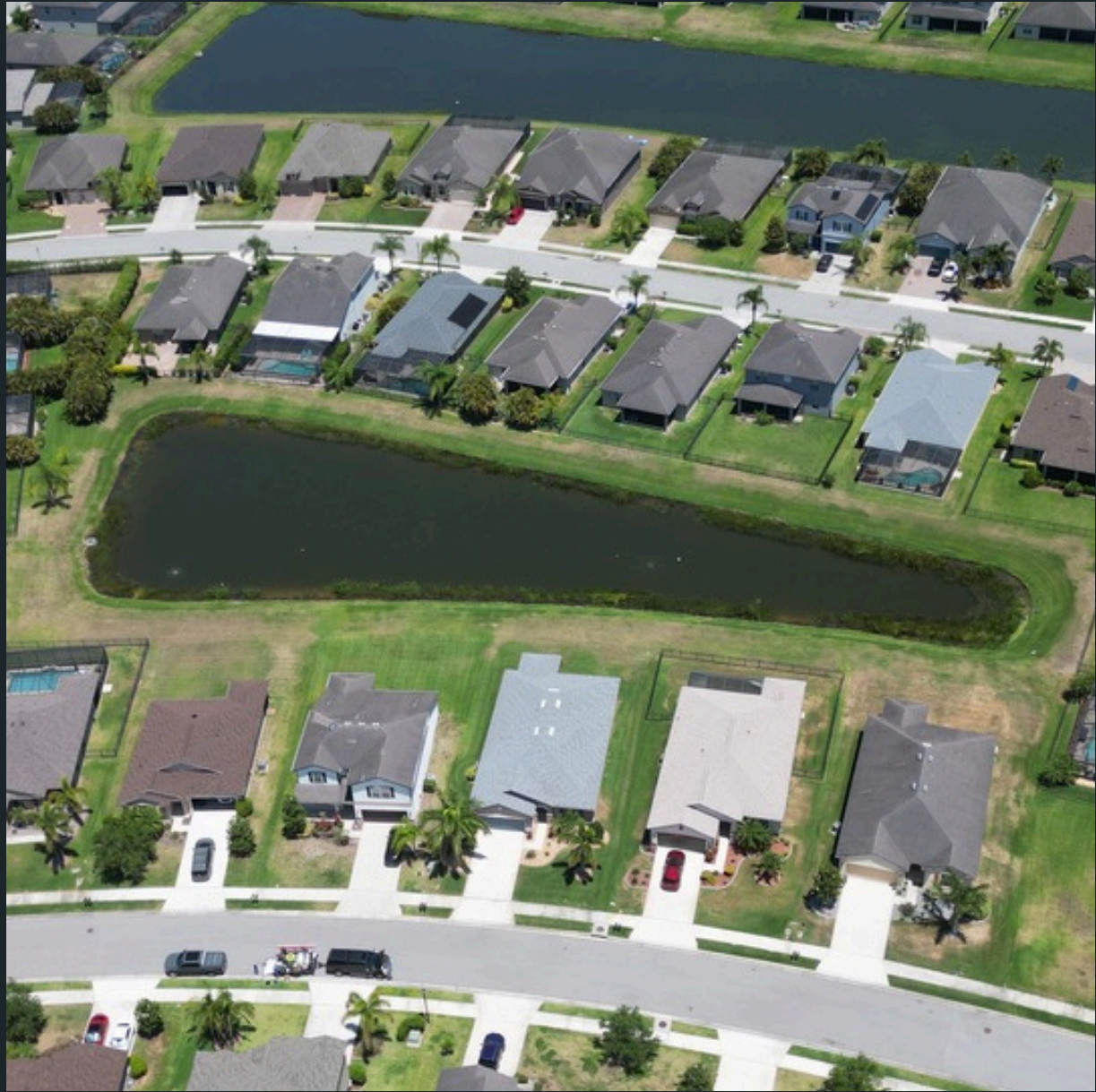
Pond #SWF39 Treated for Algae and Shoreline Vegetation.