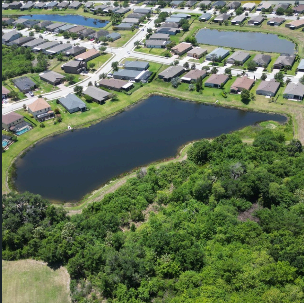
Pond #SWF37 Treated for Shoreline Vegetation.