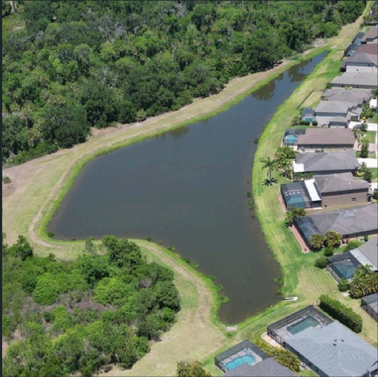
Pond #SWF41 Treated for Shoreline vegetation.