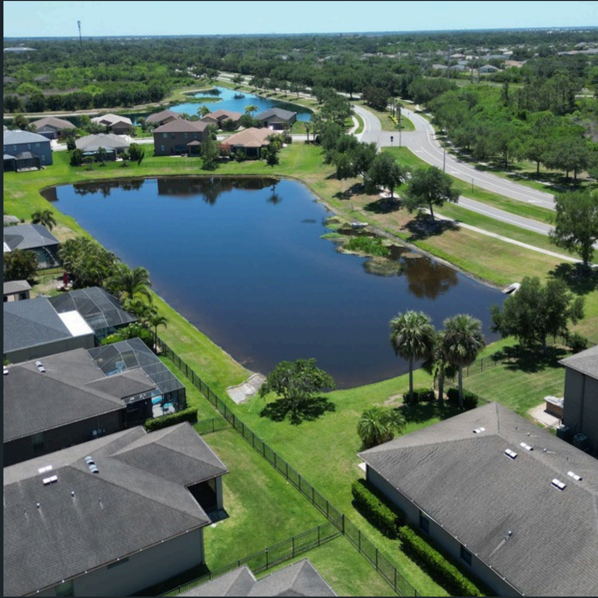
Pond #SWF20 Treated for Shoreline Vegetation.