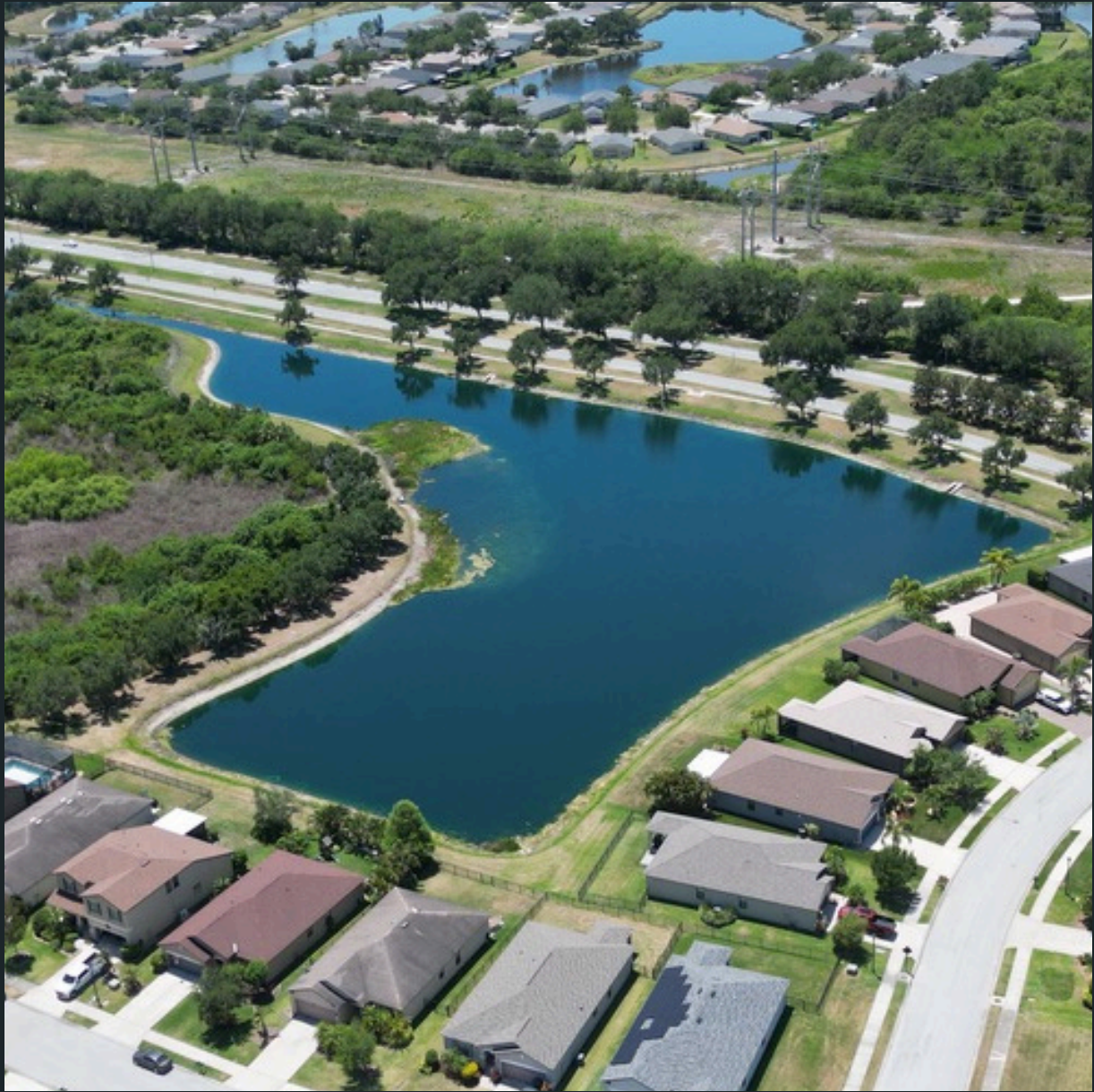
Pond #SWF21 Treated for Algae and Shoreline Vegetation.