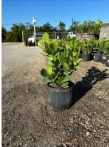
Pitch Apple - Option A