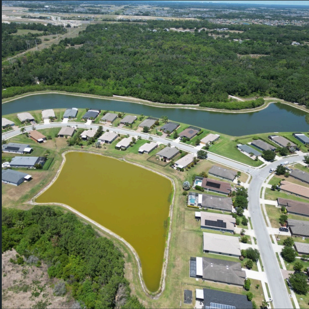
Pond #SWF36 Treated for Shoreline Vegetation.